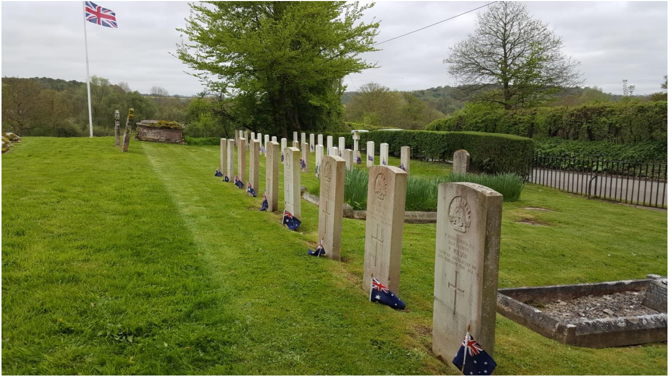
St. Edith's Churchyard, Baverstock